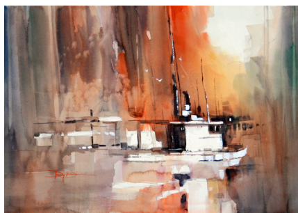
DOUG DAVIES, INSTRUCTOR

Course Description: Making the complex simple. Paint the mood of your scene in mixed media through shape, color and composition. You will learn how to take a complex subject matter and break it down to the essentials of a good painting. We will analyze shapes, tone and temperature while creating a pleasing composition that will describe your vision or reason for picking that particular subject matter.