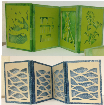
Above: Samples of work by students

"I am a printmaker, book and paper artist interested in engaging students of all ages and abilities in the transformative power of art. Although I have had a lifelong interest in art, my formal training came later in life after a career in the world of paper and graphics. I use relief and intaglio methods of printmaking, cut paper and book arts as tools for artistic expression. I am founder of Wingtip Press, Treasure Valley's community printmaking studio/workshop, and can provide portable equipment for what I call "roaming print and play."